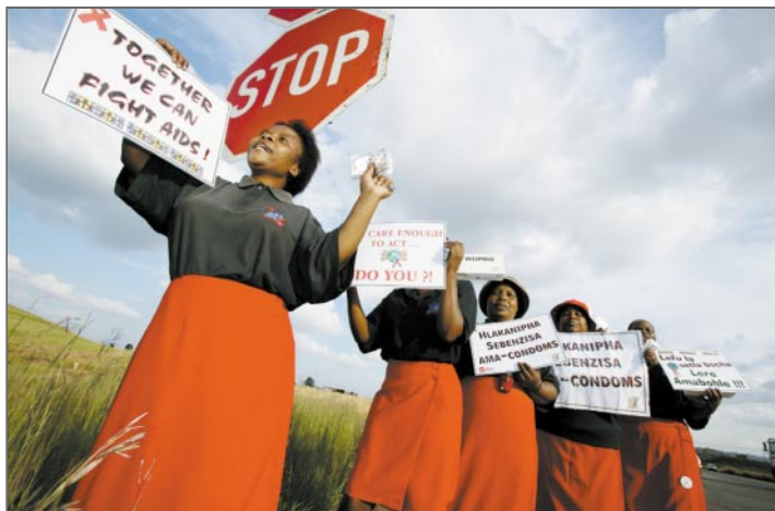
Women Passing out Condoms and Educational Leaflets in the Witbank District, Gauteng Province, South Africa.